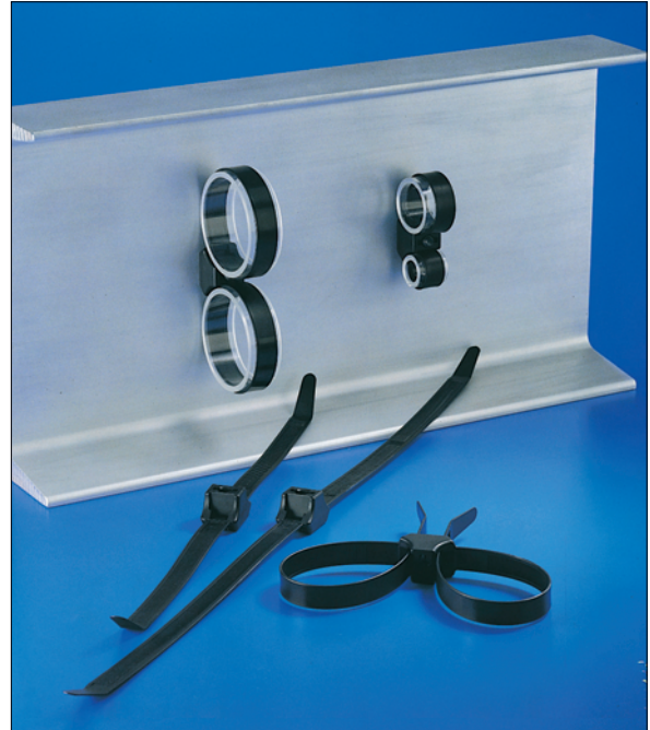
U.S. Patent Number 5,966,781

Available in two lengths, the dual clamp ties accommodate bundles ranging from .25 inches to 2.3 inches. The flexible wide straps minimize pinching of hoses and convoluted tubing. The straps are also releasable.